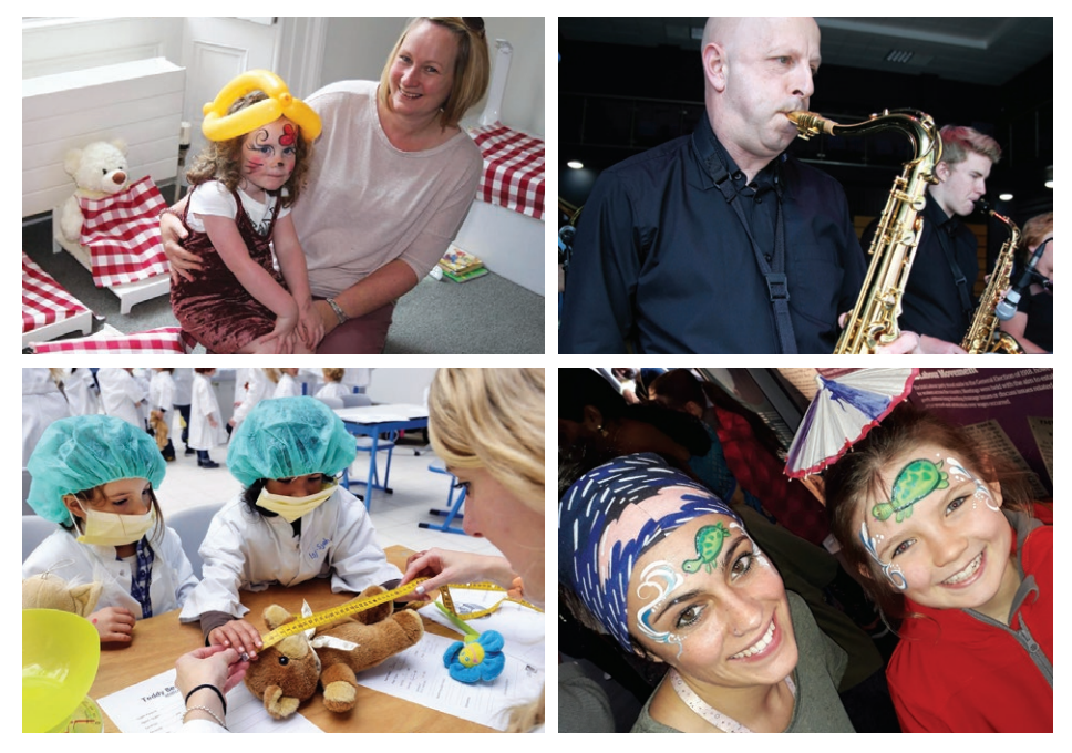
n the event of rain, outdoor activities will be temporarily suspended or moved indoors. Please walk, cycle, use public rransport or public carparks nearby. We reserve the right to make changes to the advertised programme at any time. Children must be accompanied by an adult at all times.

This project is receiving financial support from Council's Good Relations department through The Executive Office District Council Good Relations Programme.