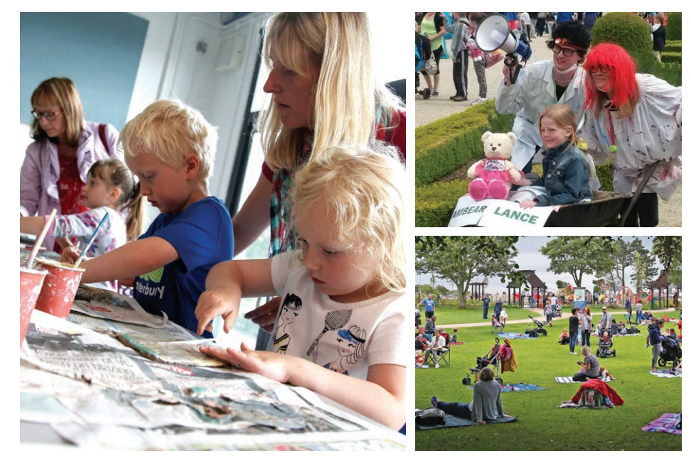
In the event of rain, outdoor activities will be temporarily suspended or moved indoors. Please walk, cycle, use public transport or public carparks nearby. We reserve the right to make changes to the advertised programme at any time. Children must be accompanied by an adult at all times.