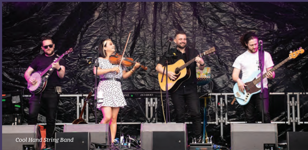
Cool Hand String Band

➤ "Local with accessible access for great classes and cultural events."